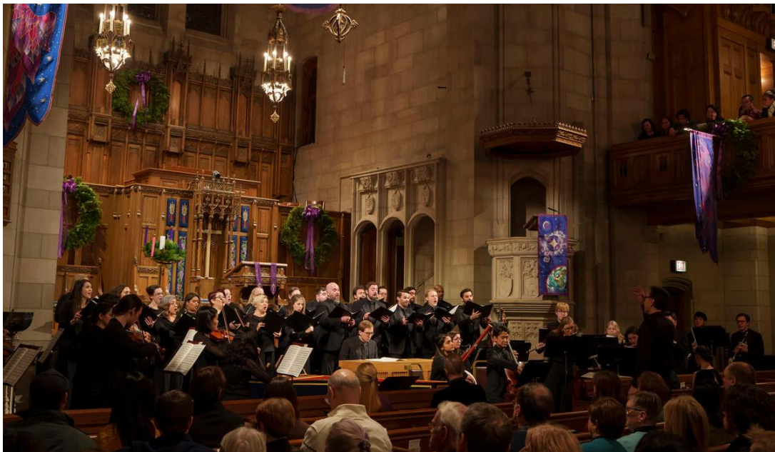
Members of the Chicago Symphony Chorus perform alongside members of the Civic Orchestra of Chicago in a Cantata by J.S. Bach at Fourth Presbyterian Church.

Many League members showed their support for the Civic by attending the evening concert at the Fourth Presbyterian Church on December 4, 2023. This year's Marathon included three Bach Concertos and two Bach Cantatas with the Chicago Symphony Chorus. This event is always a sell-out and one the League is proud to support.