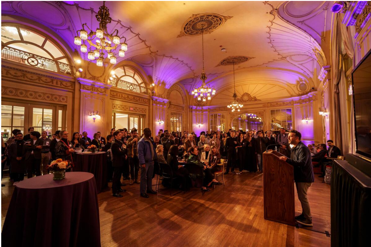
Maestro James Gaffigan (right) addresses the room during the post-concert reception.

On October 23, following the first Civic concert, the League hosted a well-deserved party for our young, incredibly talented musicians. It is always a privilege for the League to celebrate with them and honor their talent and commitment to orchestral music. In addition to the musicians, Maestro James Gaffigan, who conducted the concert, also attended. Many of the CSO musician mentors also enjoyed the festivities.