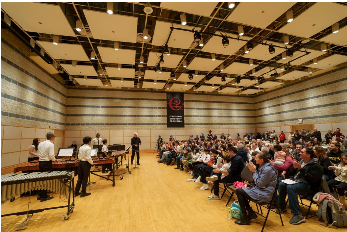
Visitors listen to students from the Percussion Scholarship Program perform during Open House Chicago.