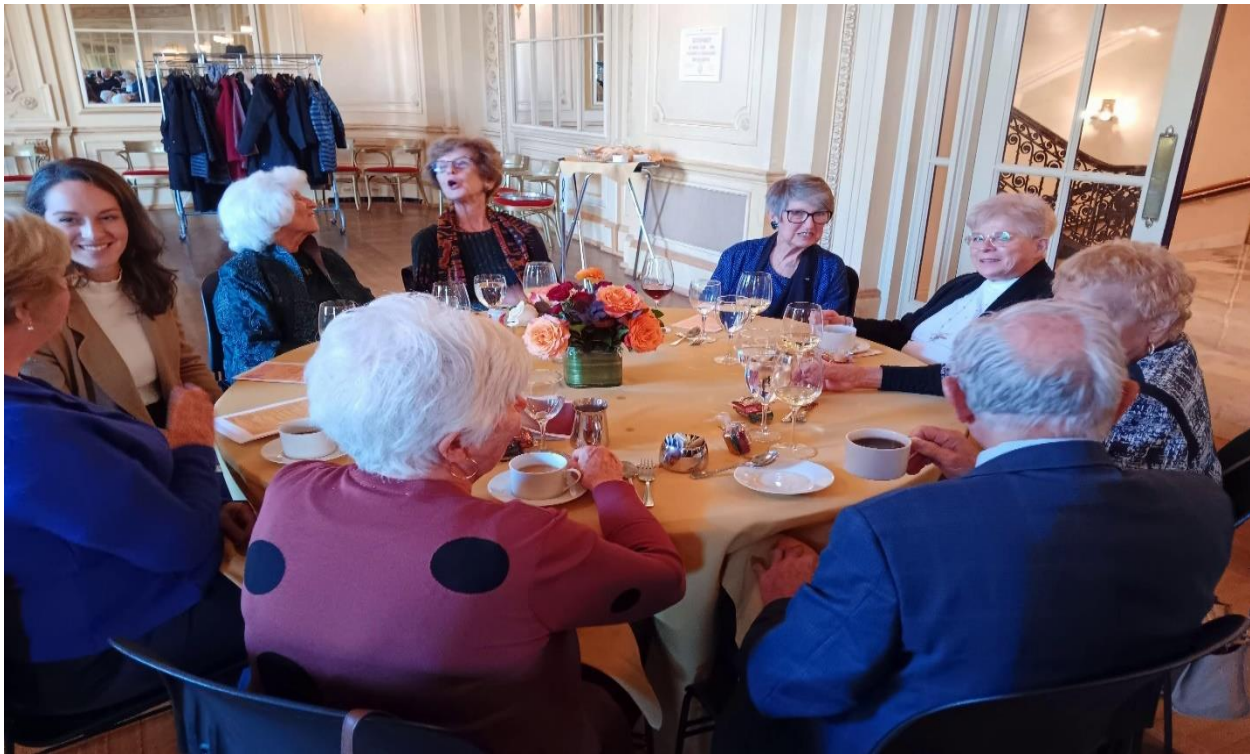
League members have a joyful conversation during Fall in Love With Music.