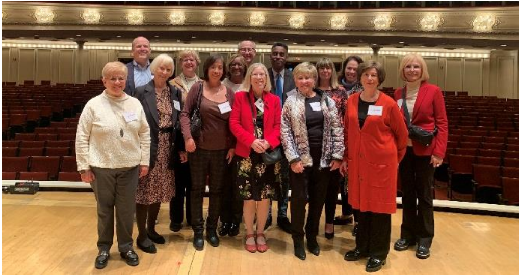
New League members pose for a photo on the Armour Stage of Orchestra Hall.