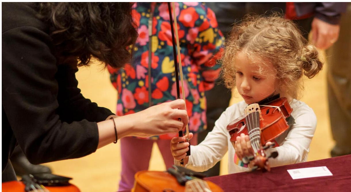
A young child trying out a violin at the very popular instrument petting zoo during Open House Chicago.