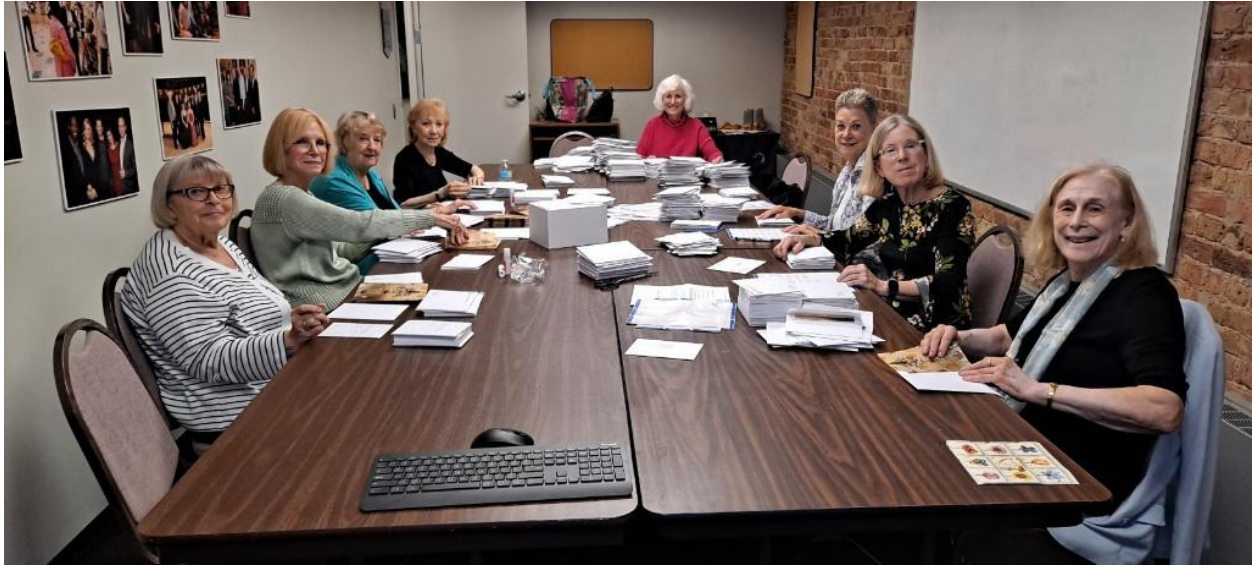
League members stuffing the invitations for Fall in Love With Music.