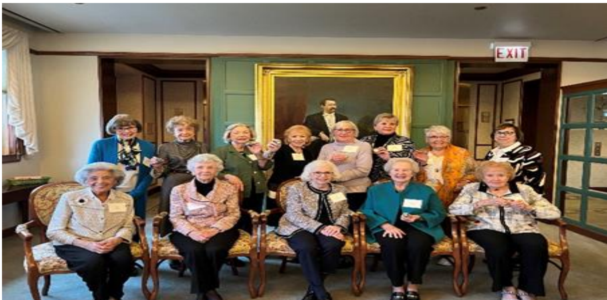
League members who have been in the League for over 30 years pose for a photo.