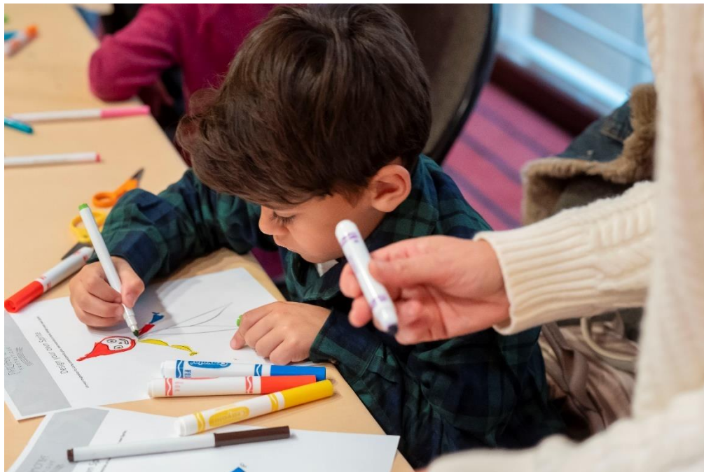
Children participate in post-concert activities in the Rotunda.

Who had more fun: the kids, their families, or we League helpers?