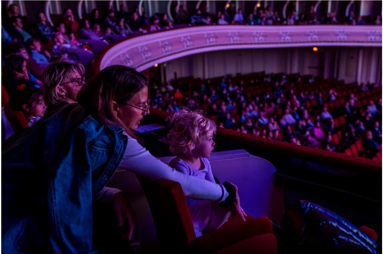
A packed house of children, parents, and volunteers watch Philharmonia Fantastique .