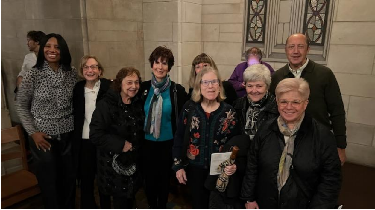
League members at the Fourth Presbyterian Church for the Bach Marathon.