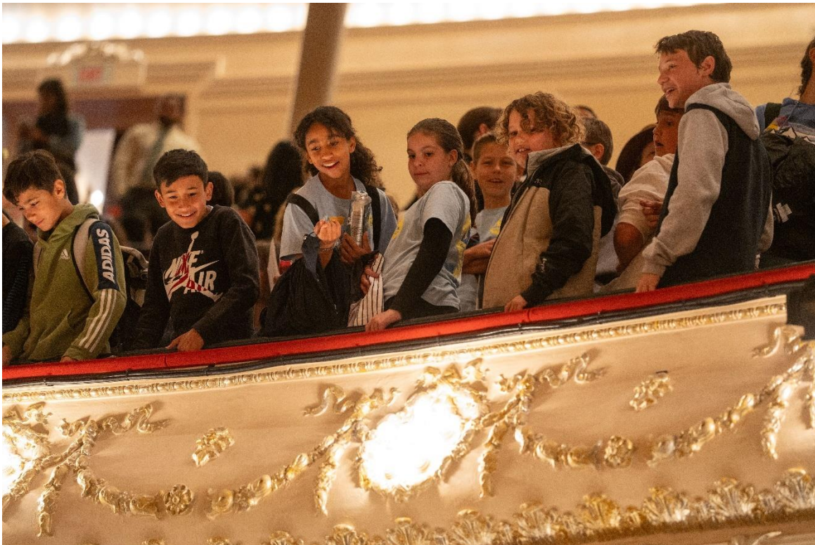
A group of students look out from the lower balcony of Orchestra Hall.

We serve as greeters and ambassadors to the students, pre-school through high school, who come to Symphony Center with their classes, teachers, and chaperones. Audible gasps of wonder can be heard from the youngest to the most "seasoned" visitors as our guests take in the beauty of the lobby, our red carpet, and Orchestra Hall! As we escort each school group, with our CSO ushers, who lead them to their seats, we see smiles all around. The chimes ring, the concert begins, and the cheers that break out at times resemble those at the Super Bowl.