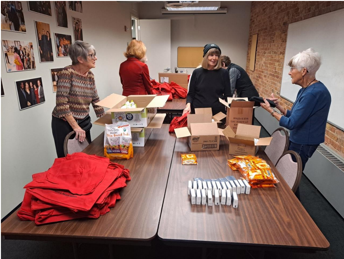
League volunteers help put together goodie bags.