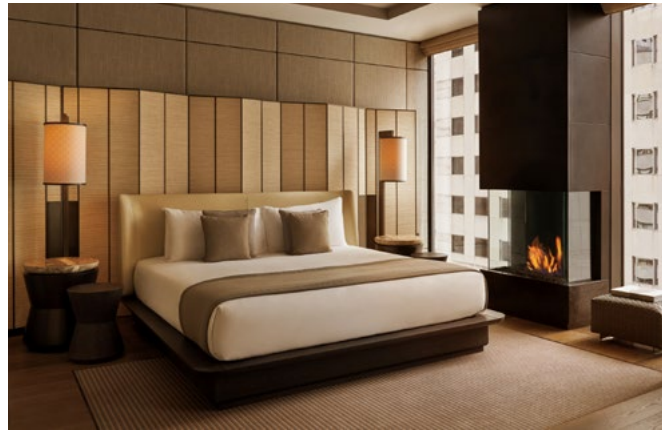
A suite at the Aman New York. Elegant, understated.

Air travel between Chicago and New York City is not included in the tour price. Transfers to and from the airport are also not included in the tour price.