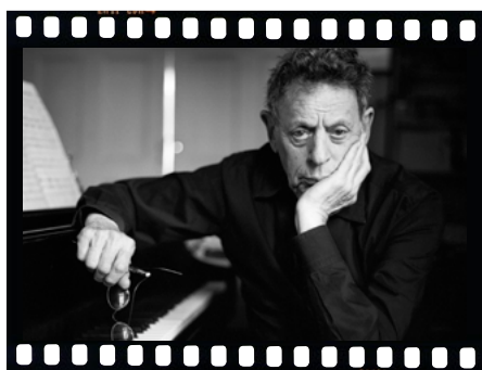
Meet Philip Glass backstage at Carnegie Hall.

After dinner, we walk to our next CSO CONCERT at Carnegie Hall. Tonight's program opens with the New York