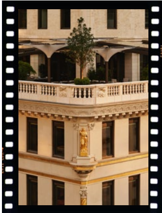
The fabled Crown Building, reborn as the Aman New York.

The tour is sold as described. There are no refunds for unused services. The tour price is based on a minimum number of 20 travelers. If the minimum number of travelers do not book by the booking deadline, the tour may be canceled, or