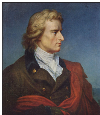
A portrait of Friedrich Schiller by Gerhard von Kügelgen

was impatient to pull together all the ideas that had been germinating in his imagination for thirty years. (And, according to Anton Schindler, only after he finished it nearly two years later "could he again be seen strolling through the streets, . . . greeting many acquaintances or friends after his long seclusion.")