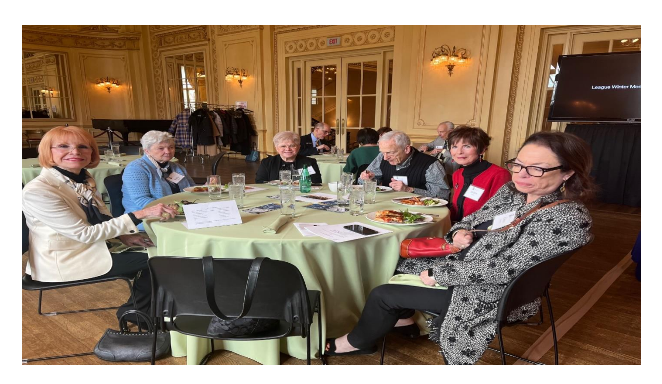
League members enjoying lunch at the Winter All-Member Meeting