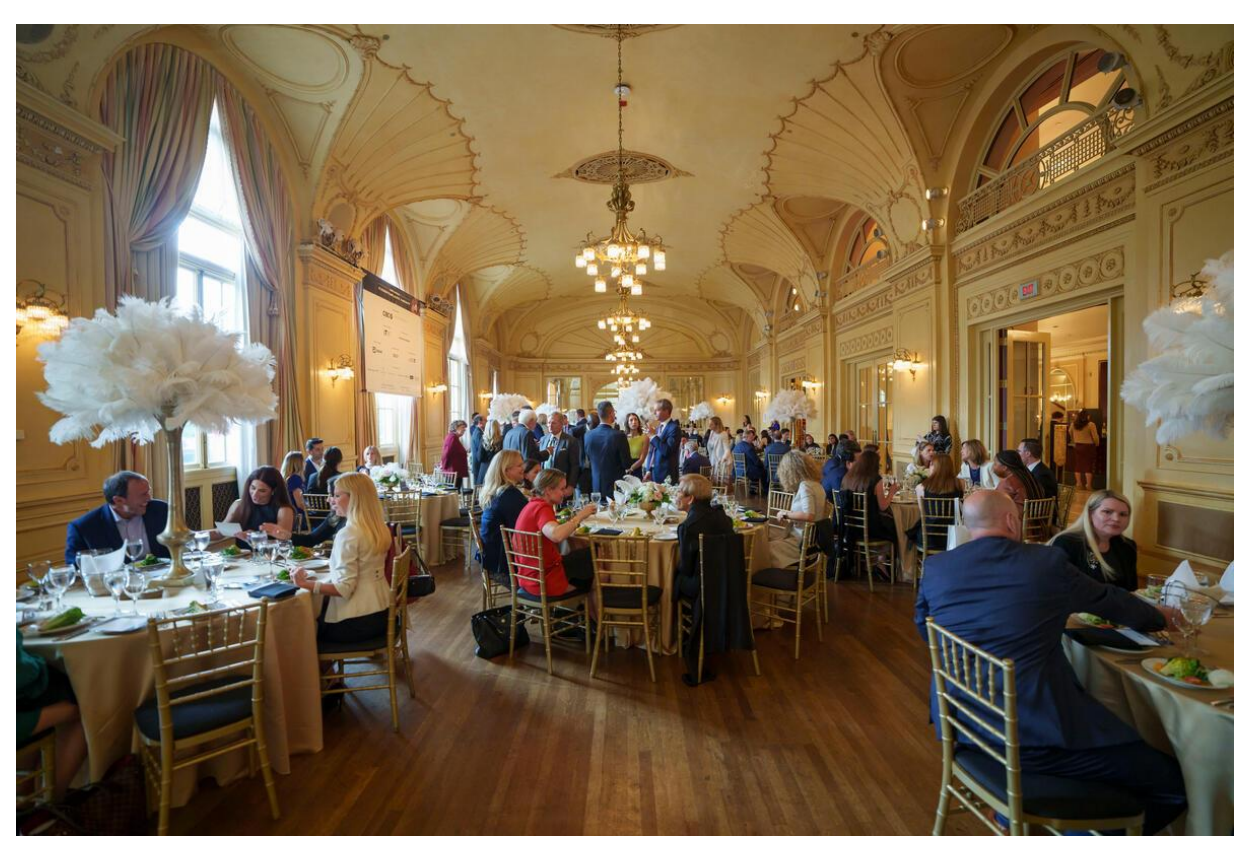
The seated dinner for corporate guests in Grainger Ballroom