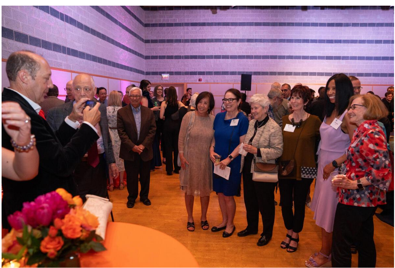
League members pose for a photo at the Civic reception