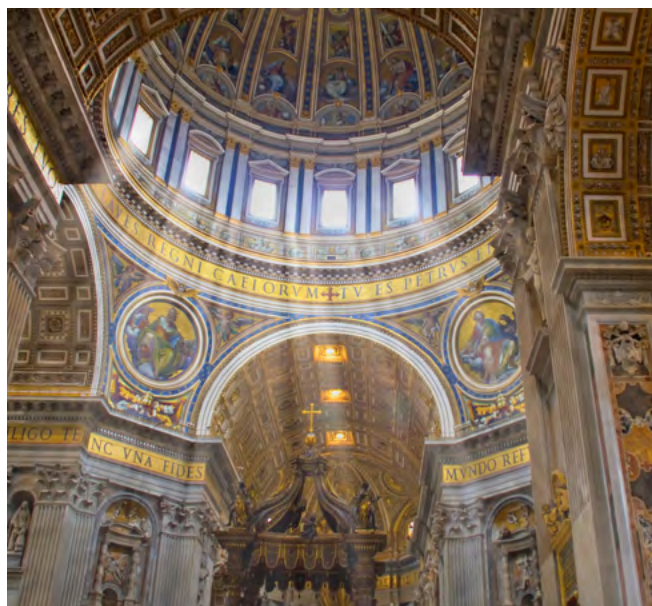
Come inside St. Peter's Basilica. Remember to look up. Rome.

At Hotel de la Ville, check in and settle into your room. Take some time to relax before we pick up a group of CSO musicians who join us for a visit to San Luigi dei Francesi Church to view Caravaggio's phenomenal "St. Matthew Cycle." Then sit down to dinner with the musicians at the lively Tre Scalini Restaurant in Piazza Navona.