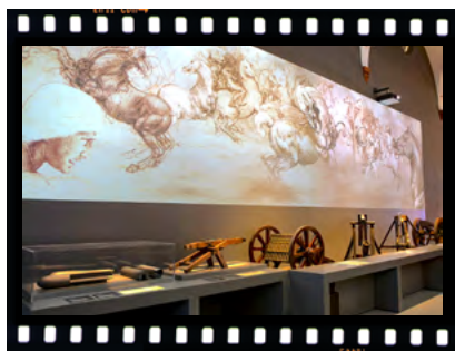
Get to know a different side of da Vinci.

Enjoy some free time. If you'd like, join us for a look at da Vinci's "The Last Supper" at the Convent of Santa Maria delle Grazie.