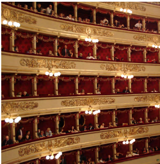
La Scala: Beautiful music, world-class elegance. Milan.

In Rome, we begin at the Borghese Gallery, where a curator shows us the collection's most significant works.