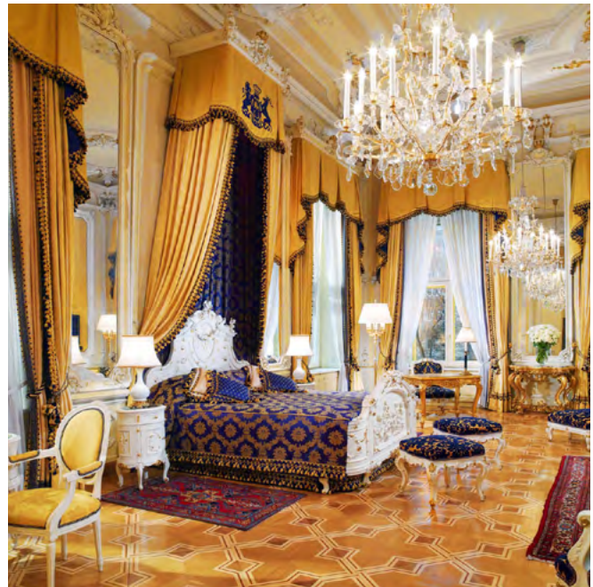
Vienna's Imperial Hotel: the Golden Age defined.

✳ Cancellation. Cancellations must be received in writing. Cancellations received 90 days or more prior to departure are subject to a $1,500 per person cancellation fee; 89-60 days, 50 percent of the tour cost; 59-30 days, 75 percent of the tour cost; and 29 days or less, 100 percent of the tour cost.