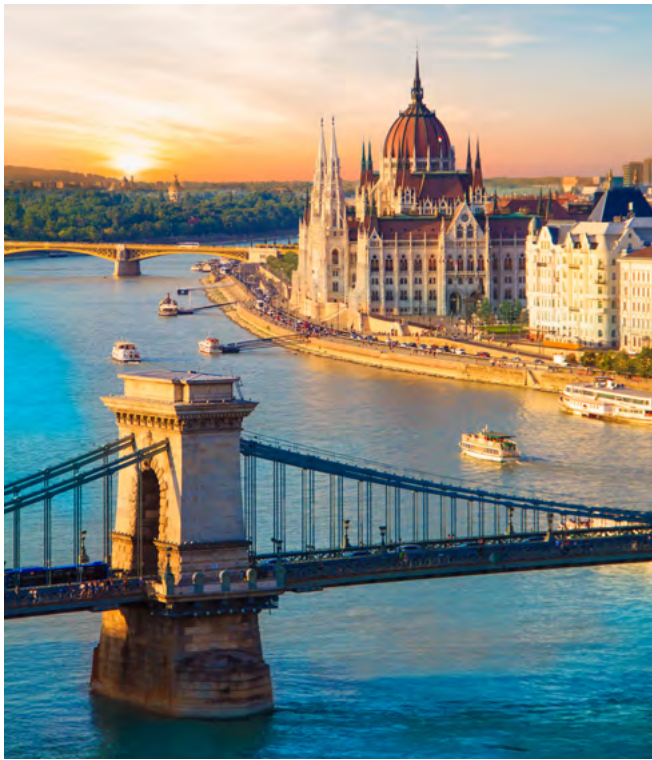
Visit Budapest's domed Parliament on the River Danube.