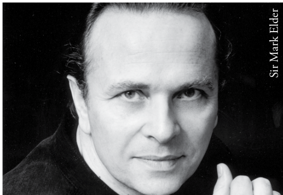
Sir Mark Elder

Chicago Symphony Orchestra Sir Mark Elder conductor Stephen Hough piano Liadov Baba-Yaga Liadov The Enchanted Lake Tchaikovsky Piano Concerto No. 1 Prokofiev Symphony No. 5