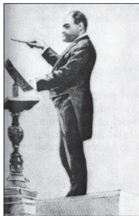
An image believed to be Dvořák conducting at the World's Columbian Exposition in 1893

The opening theme—pointedly in G minor, not the G major promised by the key signature—functions as an introduction, although, significantly, it is in the same tempo as the rest of the movement. It appears, like a signpost, at each of the movement's crucial junctures—here, before the exposition; later, before the start of the development; and finally, to introduce the recapitulation. Dvořák is particularly