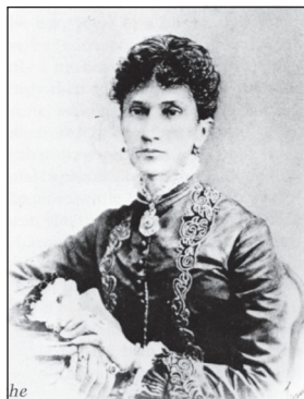
Tchaikovsky’s patron, Nadezhda von Meck

two polar-opposite themes, had seemed all wrong to Tchaikovsky to open the suite, but here it makes a thrilling finale to the fantasy. Now Tchaikovsky seems to relish the dualism of his two main ideas—a slow melody over strumming arpeggios and a fast folklike dance tune—dramatically juxtaposing them and ultimately combining them to great effect. The entire fantasy is a novel way of writing a big showpiece for piano and orchestra outside the grand concerto tradition, but Tchaikovsky continued to worry over its design. At one point, he even wrote a new ending for the first movement (it is based on the Contrasts material) so that it could be performed separately. But for many decades, and partly because of its idiosyncratic form, the concert fantasy was rarely played at all. ■