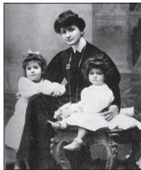
Alma Mahler with her children

All three of these works—the last of his eleven symphonic creations—were written while Mahler was obsessed with the idea of death, and in various ways they all reveal how deeply he was shaken by its immediacy. But Mahler didn't give in without a fight—even though his doctors tried to restrict his diet and warned him to cut out the swimming, cycling, and hiking he so enjoyed. His last four years, packed with conducting engagements, intense spurts of composition, and personal affairs (a meeting with Sibelius in 1907; posing for Rodin in 1909; and a single, dreaded, often-postponed session with Freud in 1910) hardly reflect the routine of an invalid.