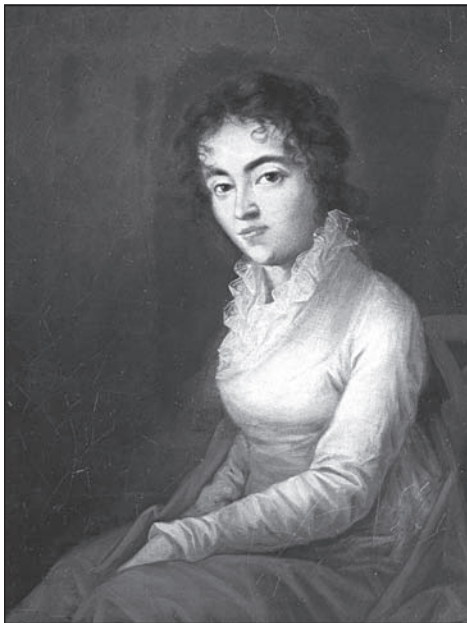
Mozart's wife Constanze. Oil portrait by Joseph Lange painted about 1782, Vienna

performances of three of Mozart's new quartets dedicated to Haydn, attended by Haydn himself, who told Leopold that "your son is the greatest composer known to me either in person or by name," a tribute Leopold would proudly repeat verbatim in the months ahead. During the day, Wolfgang maintained his teaching schedule, with a steady stream of pupils showing up at the Mozarts' lavish, though disorderly lodgings. (Leopold eventually warmed to Constanze, but he never thought she was a