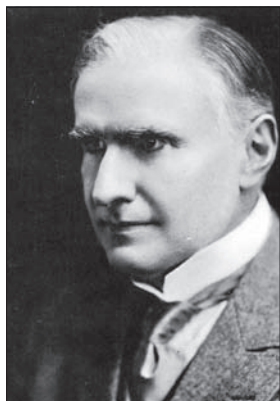
German-born American conductor and composer Walter Damrosch

Immediately after Walter Damrosch led the premiere of Copland's Organ Symphony at Aeolian Hall in New York, he