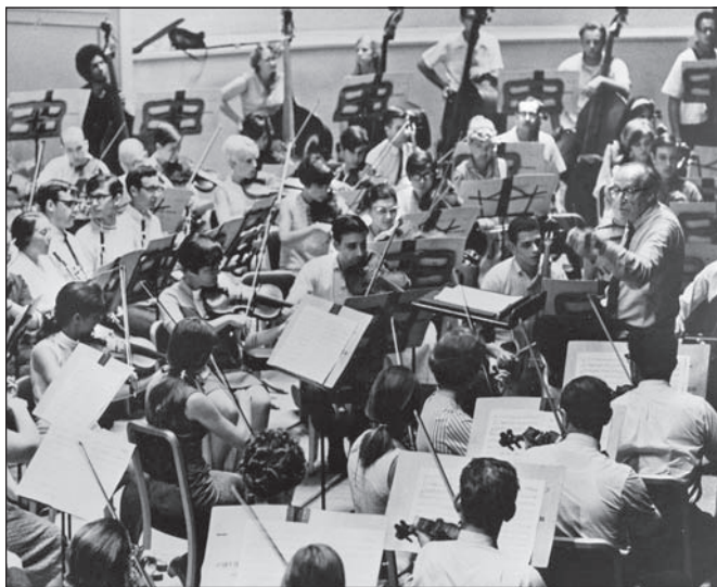
Composer Aaron Copland leads the musicians of the Civic Orchestra in a reading session in July 1968.

confirming that Copland had an uncanny knack for putting his finger on the musical pulse of this country.