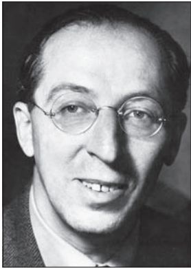
Aaron Copland, the “president of American music”

Aaron Copland, the “president of American music” (Virgil Thomson’s phrase) grew up in Brooklyn, lived most of his life in New York, and knew the rest of this country largely by hearsay. His music for Agnes de Mille’s Wild West ballet