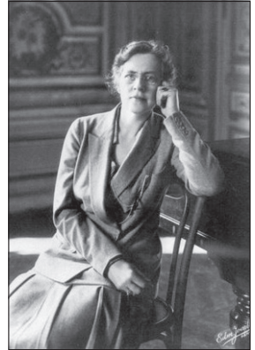
French composer and organist Nadia Boulanger

Copland opens with a quiet Prelude—"an introductory reverie for the organ, with some incidental material for solo instruments from the orchestra," in the composer's words. The middle movement is the one that Copland heard when